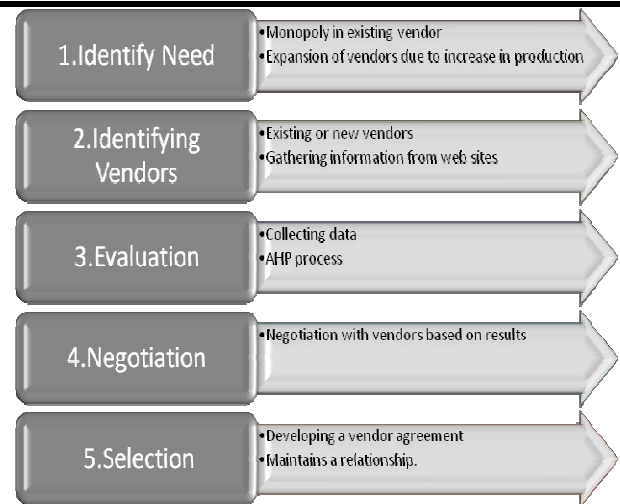
Fig. 1: Supplier Selection Process

Supplier selection is generally considered as five phase process starting from the realization of the need for a new supplier, determination and formulation of decision criteria; pre-qualification; final supplier selection; to the monitoring of the supplier selection (Choy and Lee, 2002). At first, evaluation and assessment task needs the identification of decision characteristics against which the potential suppliers are to be assessed. Next evaluation seals are selected in order to measure the appropriateness of a supplier. The next step is to assign weight to attributes to identify the significance and contribution of each criterion to the supplier evaluation and assessment. Then an attribute may comprise of several sub attributes. The last stage is to evaluate potential suppliers against the characteristics identified at the beginning (Choy and Lee, 2002).